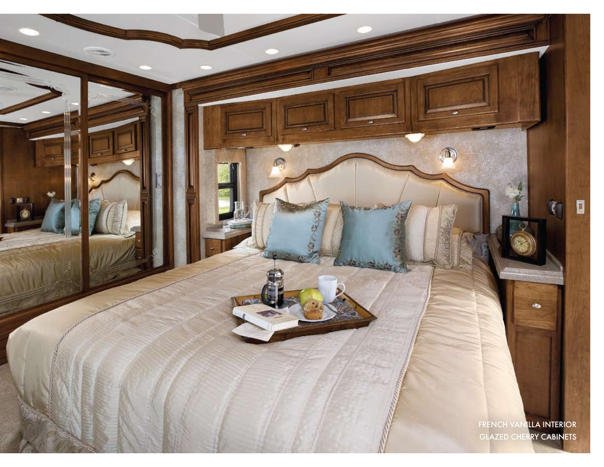
FRENCH VANILLA INTERIOR GLAZED CHERRY CABINETS