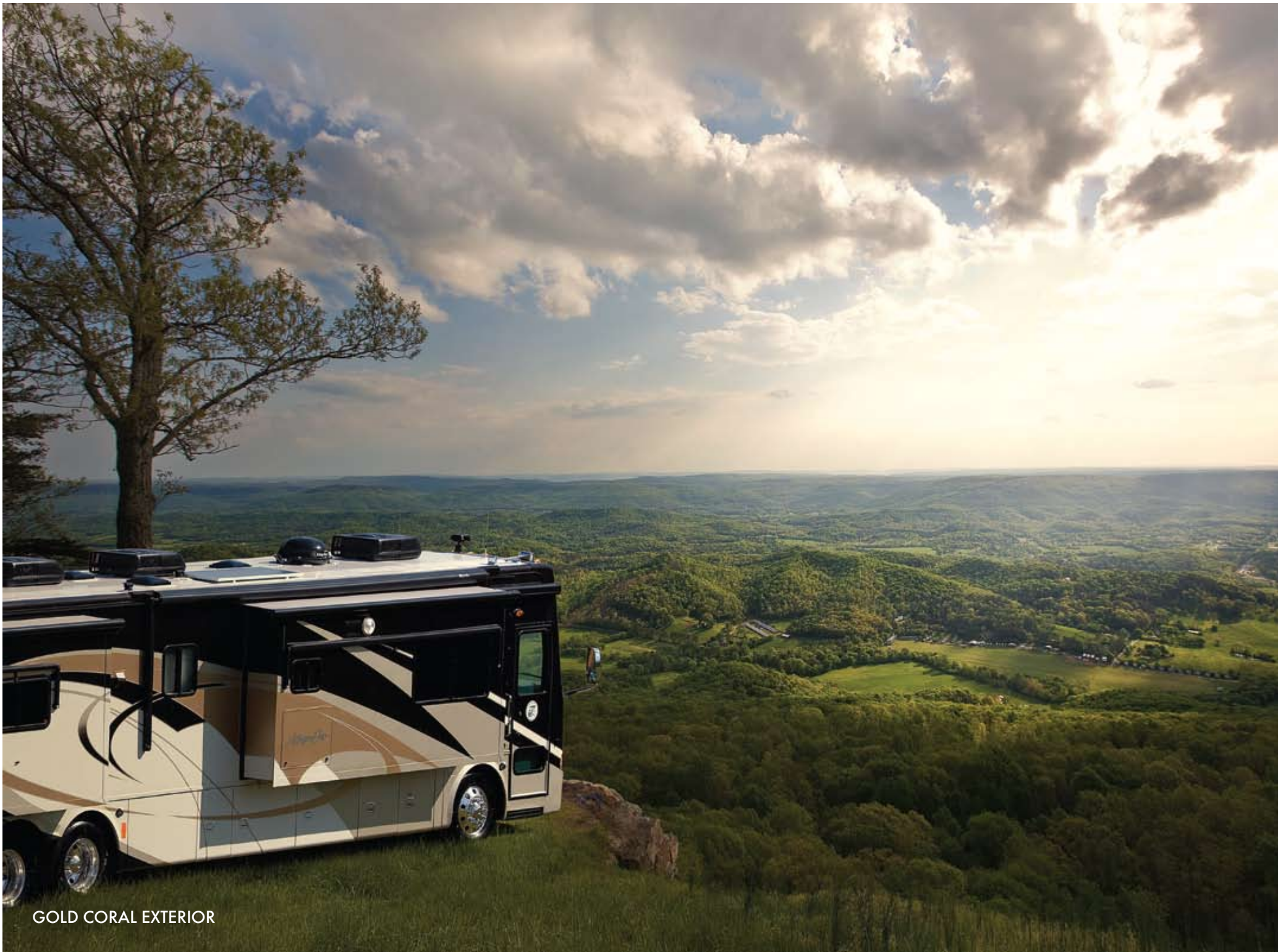
GOLD CORAL EXTERIOR