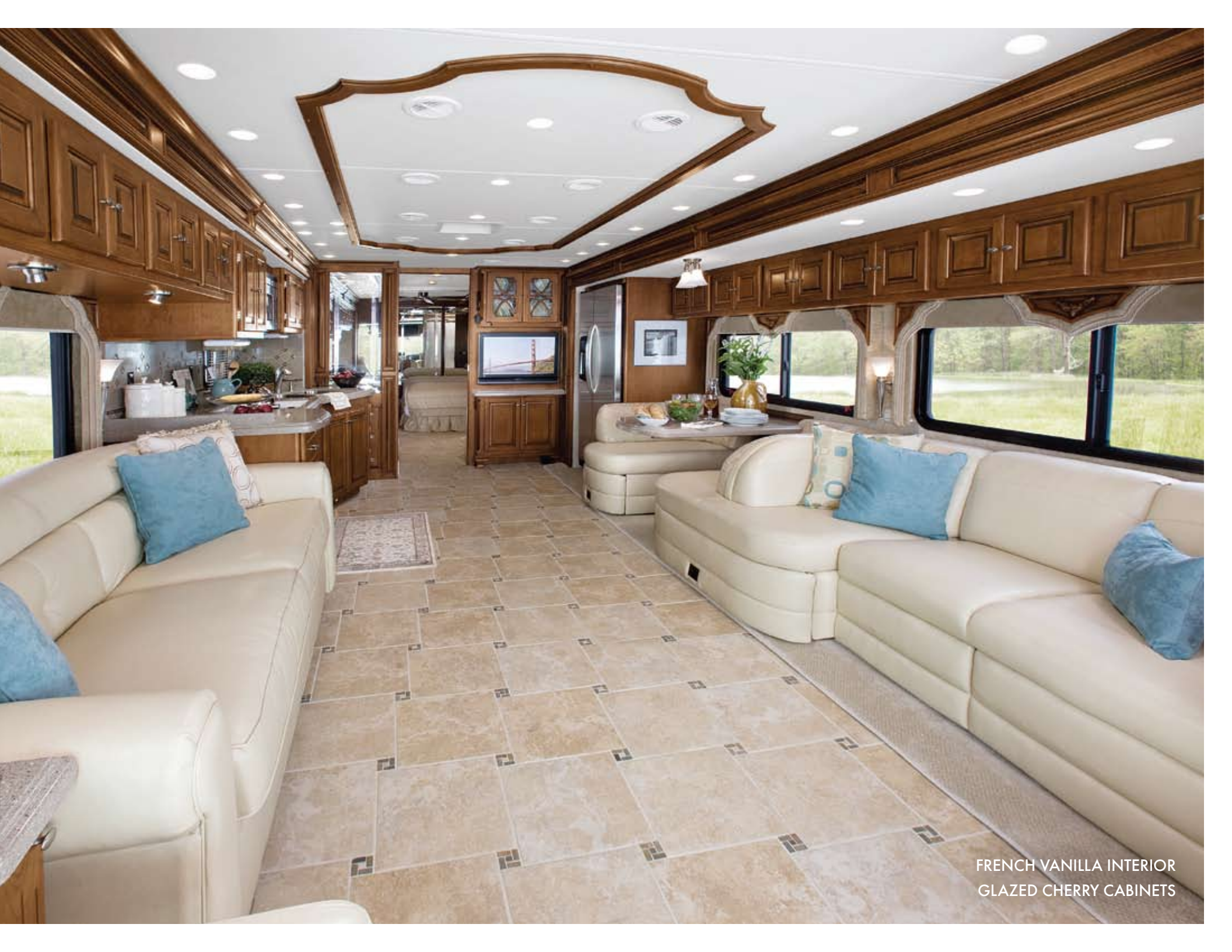
FRENCH VANILLA INTERIOR GLAZED CHERRY CABINETS