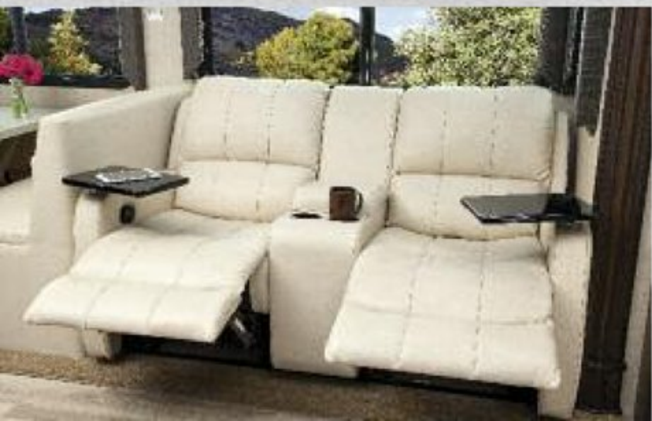
Optional Dual Reclining Theater Seats in place of Sofa