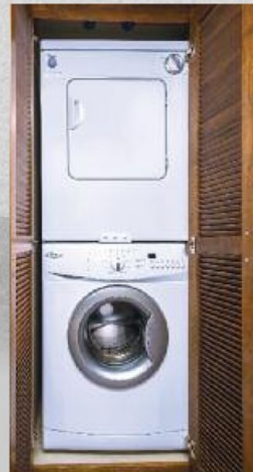
Optional washer and dryer