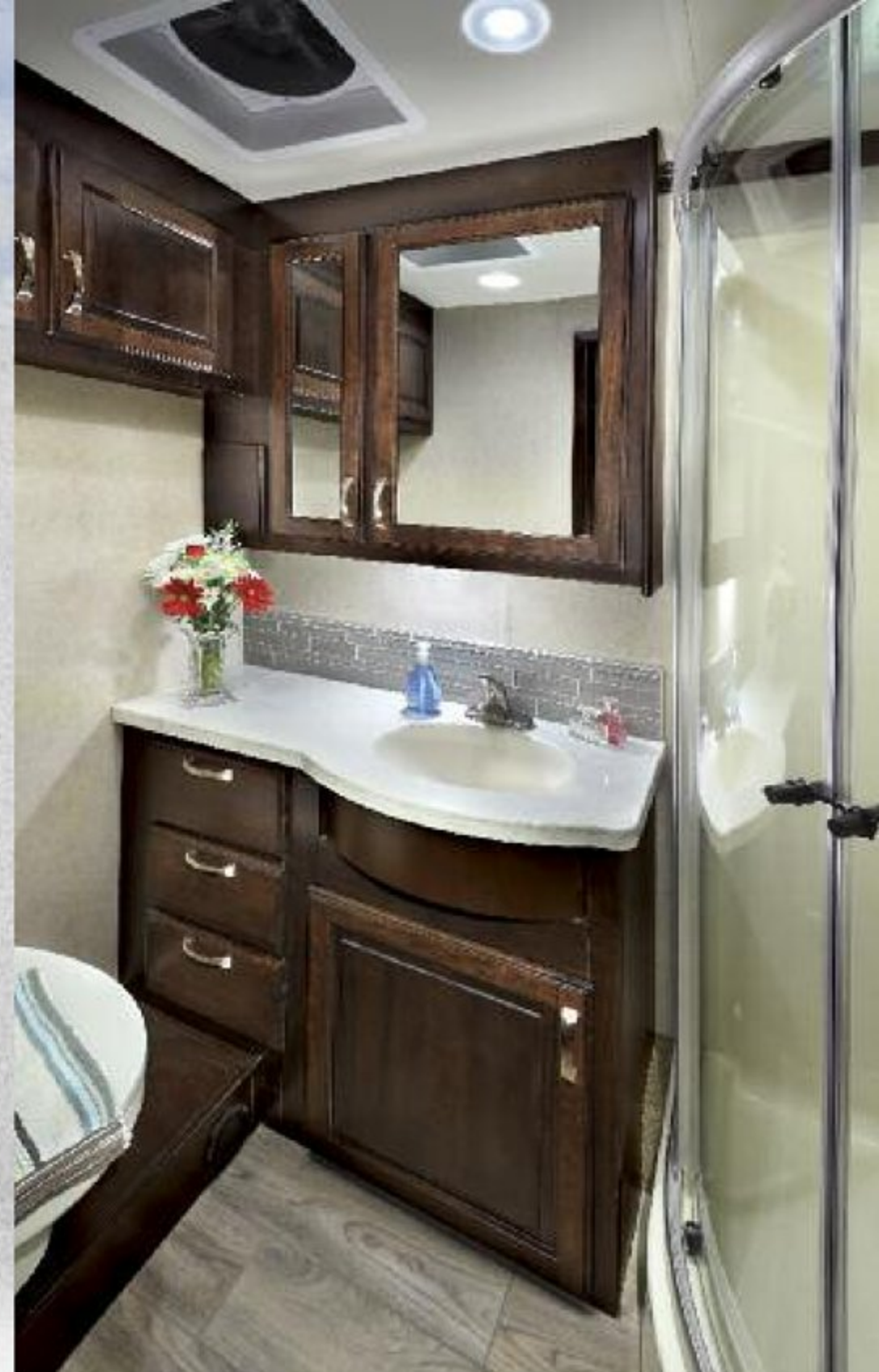
37BH with Rich Caramel Cabinets