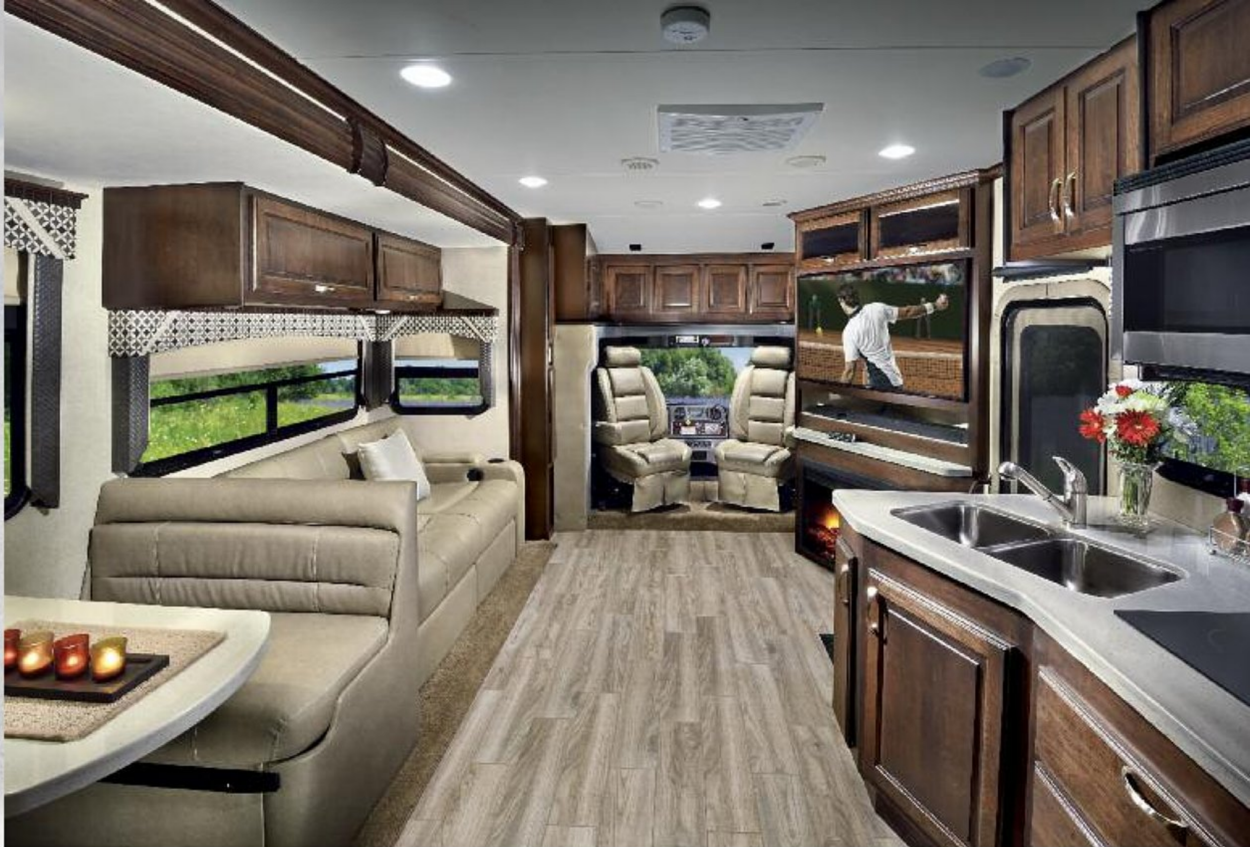
37BH with Brindle Decor and Rich Caramel Cabinets. Optional Entertainment Center with 50" TV and Fireplace in Place of Love Seat Shown.