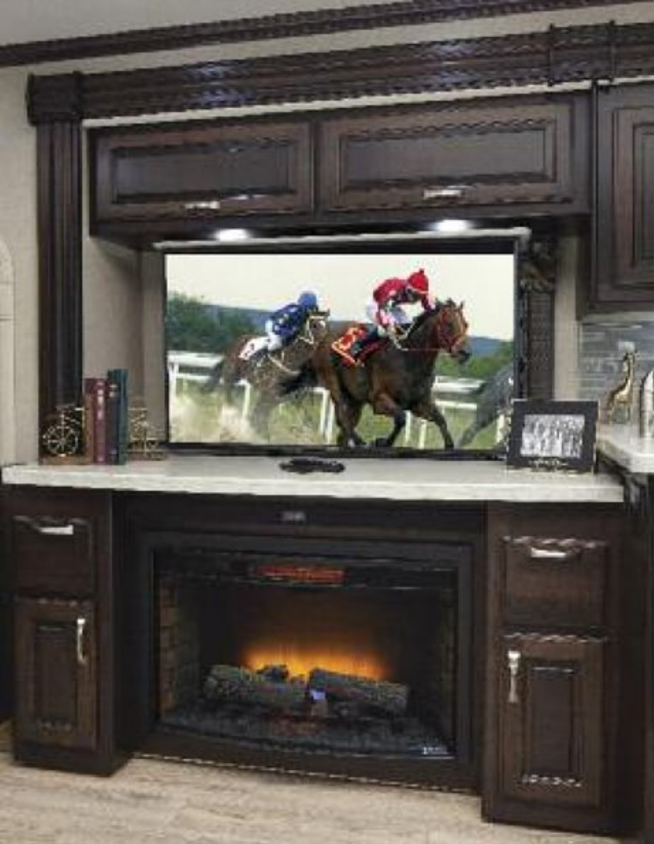
Optional Entertainment Center with 50" TV and Fireplace in place of Comfort Lounge