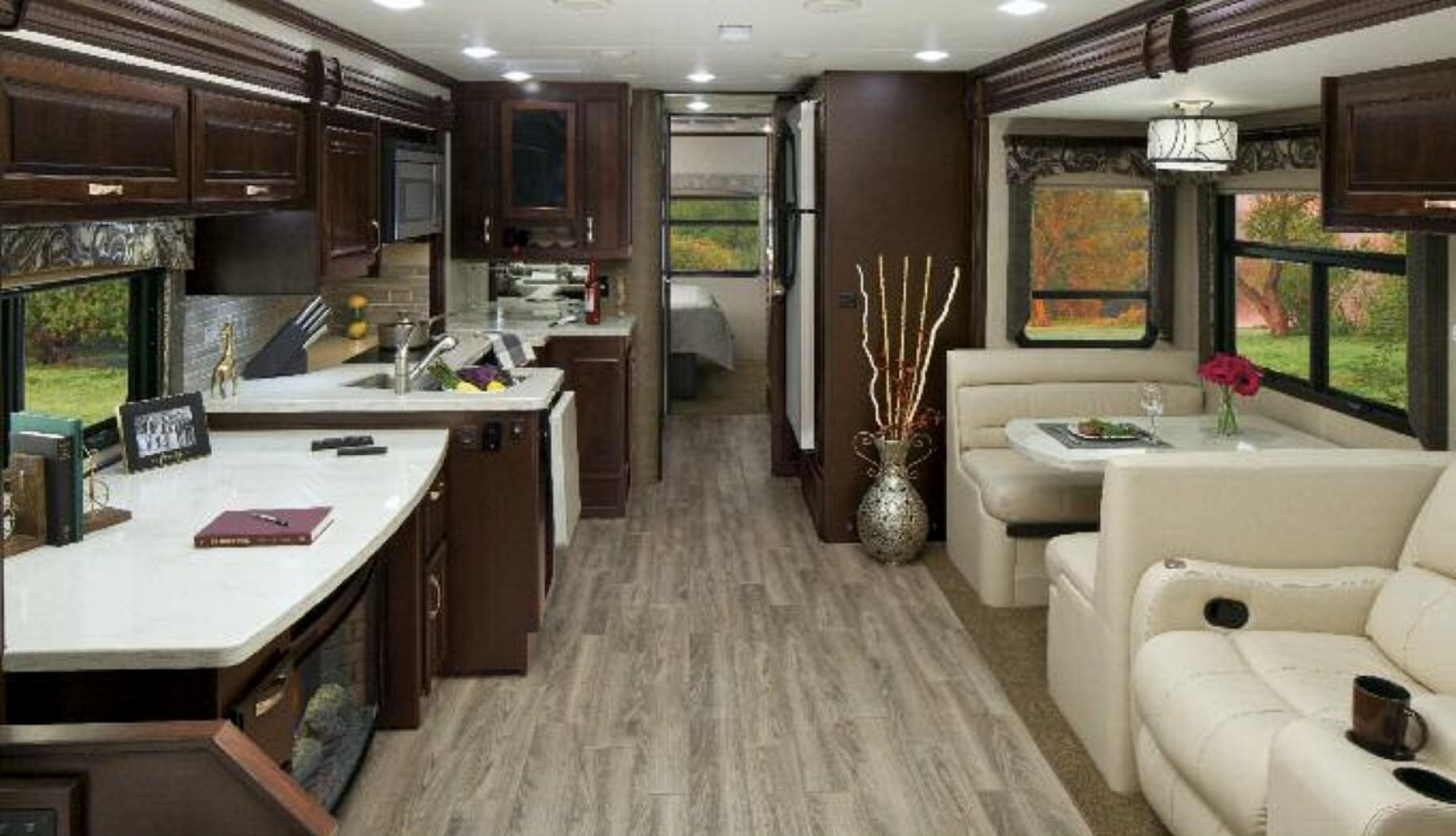
37TS with Marble Decor and Rich Caramel Cabinets. Dual Reclining Theater Seats in Place of Sofa and Entertainment Center with 50" LED TV and Fireplace in Place of Comfort Lounge Shown.