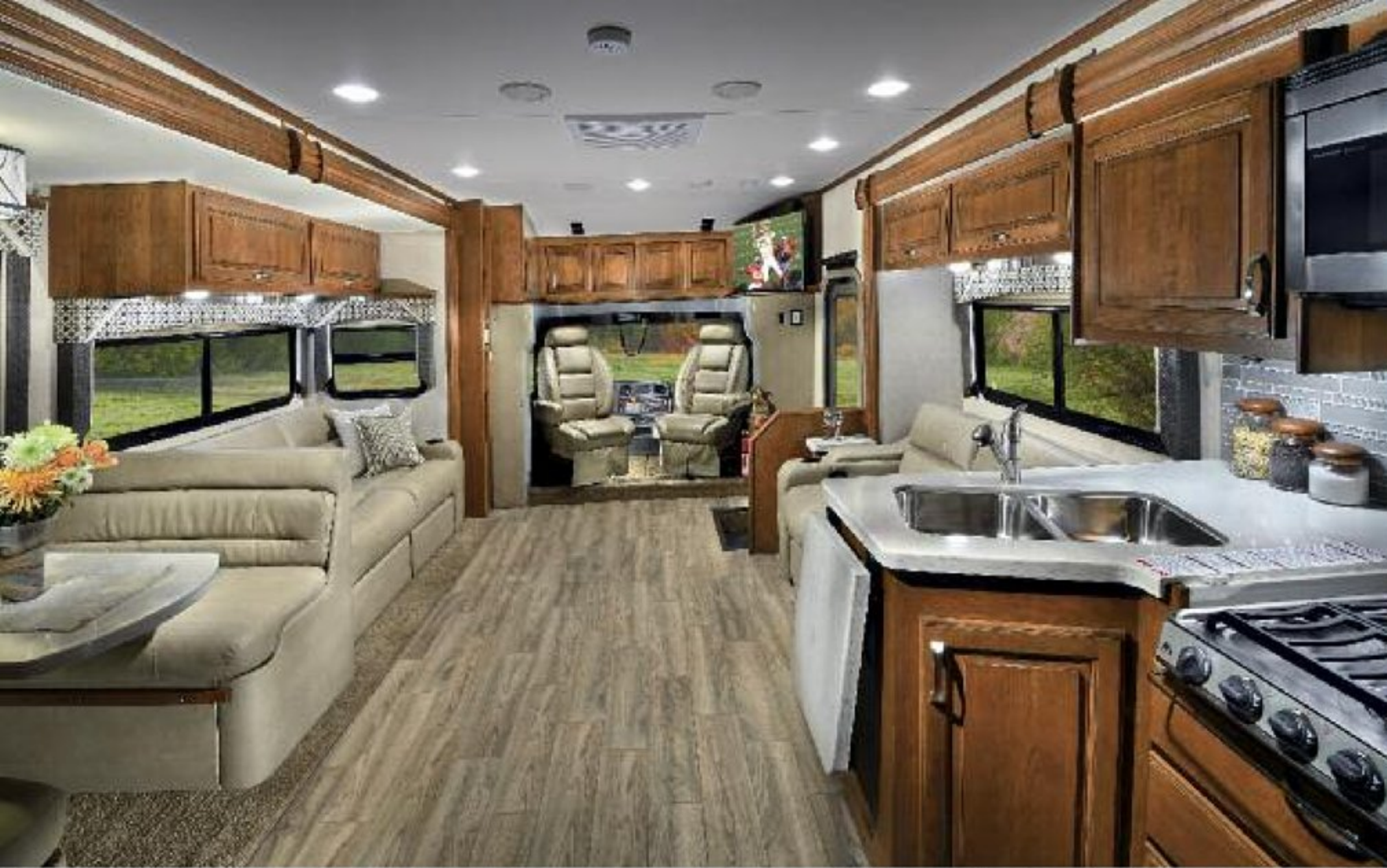
37TS with Brindle Décor and Early American Cherry Cabinets