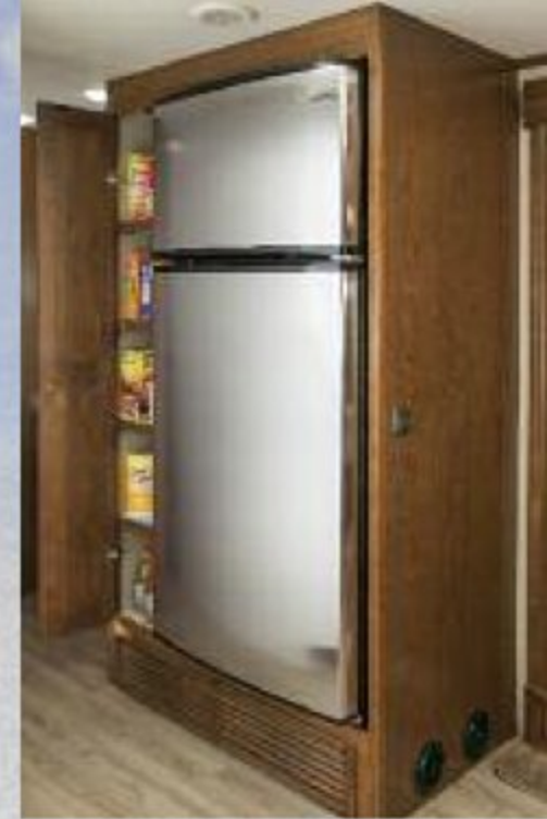
DX3 models feature a residential stainless steel refrigerator with an ice maker.