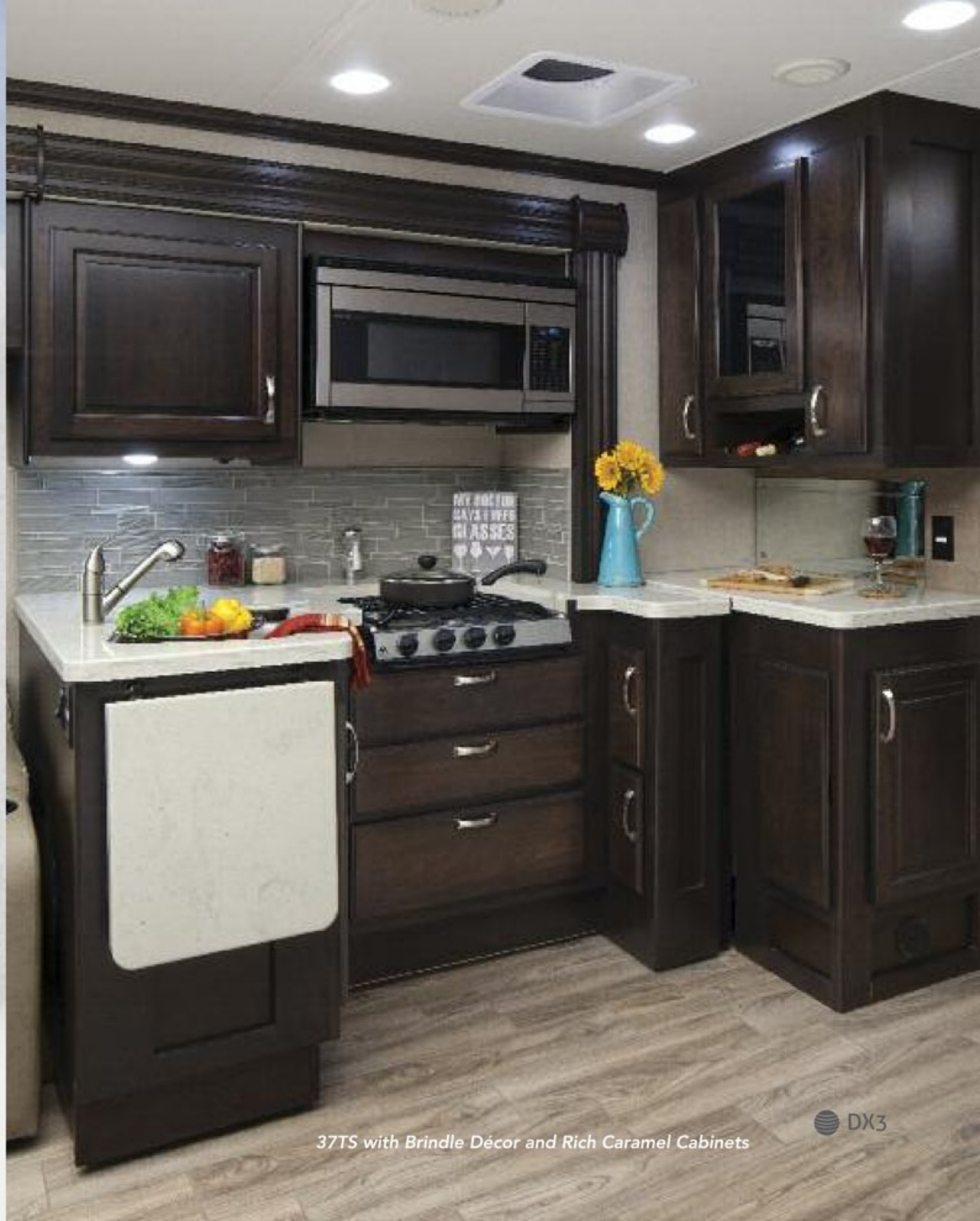
37TS with Brindle Décor and Rich Caramel Cabinets