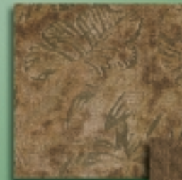
Living Room Coordinate