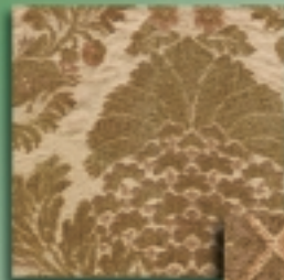
Living Room Coordinate