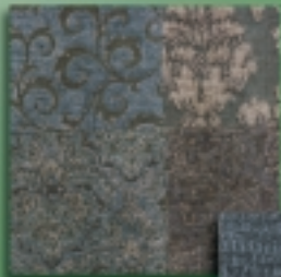
Living Room Coordinate