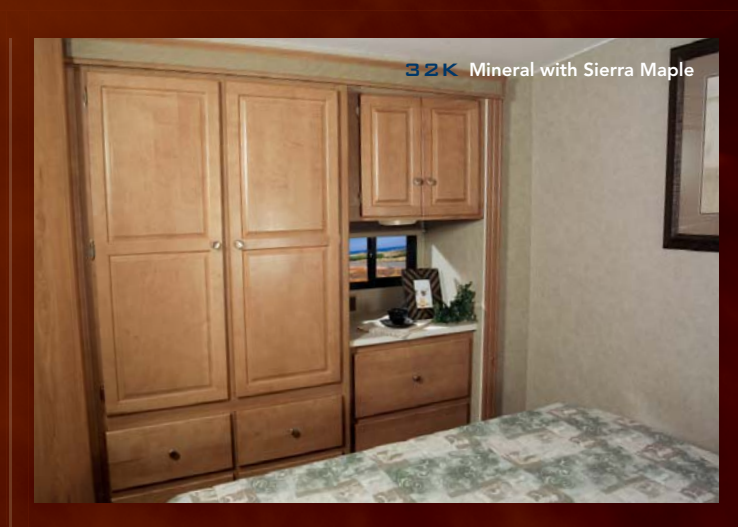
BEDROOM Get settled in the bedroom with a walk-around queensize bed, wardrobe and an abundance of storage cabinets.