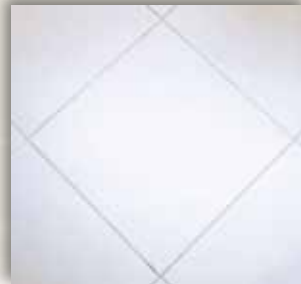
HIGH GLOSS CERAMIC TILE