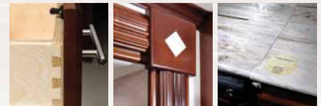
Model 406QS shown.

Inside you will find smart floorplan designs accentuated with high-end residential appointments such as Corian™ countertops throughout, high-gloss ceramic tile floors, optional Residential Hardwood Package with dovetail drawer construction, comfortable designer furniture and a host of eye catching appointments and user friendly features.