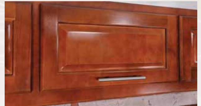
Model 404RB shown this page.