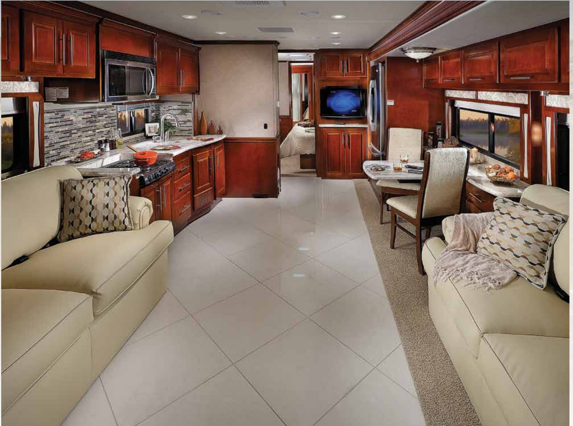
Model 404RB shown this page.