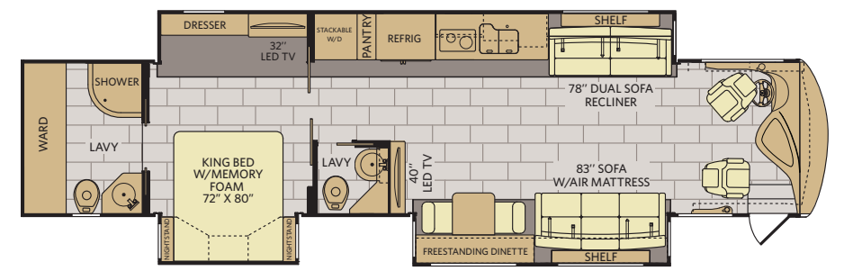
Available options: 087, 107, 635, 830, 856