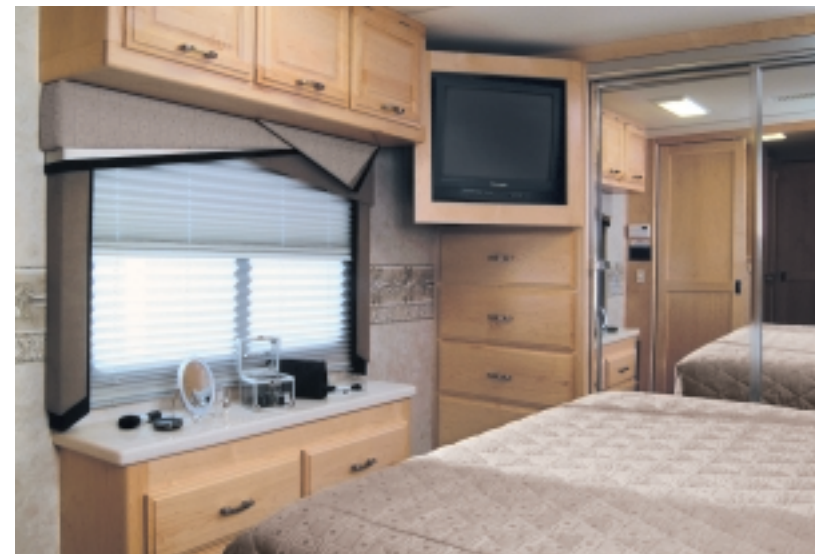
38 B Bedroom shown with Onyx interior and Clear White Maple wood.

In the bedroom, we've provided storage, storage and more storage! If you want to bring it, we're sure it will fit into the full wardrobe, spacious overhead compartments or the optional base cabinet. You'll also appreciate the large 20" television conveniently mounted on a handy swivel base, beautiful Corian® nightstand tops, and pleated day & nightshades.