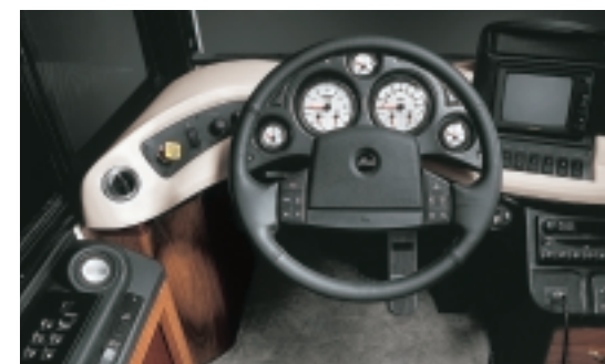
38 B Shown with Onyx interior & Clear White Maple wood.

Driving Revolution will definitely appeal to your independent spirit. You are in complete control with a wide array of standard features including DSS Trackvision, upgradeable to the In-Motion DSS System, adjustable foot pedals, rear vision camera and monitor package, and European styling all around. Our Smart Steering Wheel is a steering column that tilts, telescopes, and has a gauge panel to give you maximum comfort while driving. And we've put control of headlights, wipers, cruise control, power sun visors and sound at your fingertips.