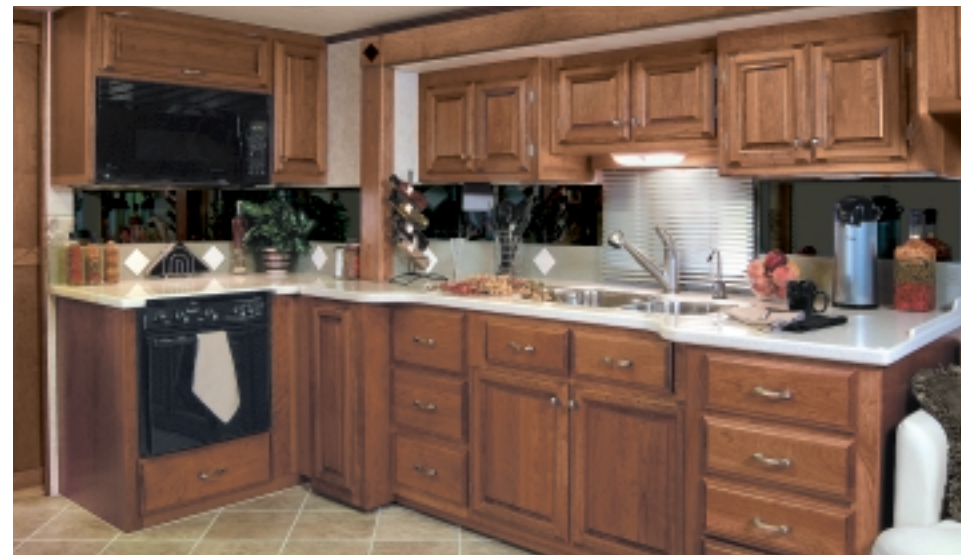
40 C Shown with Topaz interior & Natural Walnut wood

Throughout Revolution options rule! You can choose from nine stunning wood and fabric combinations, and rich, ultraleather furniture with color-coordinated inserts. Quality Fabrica® carpet and luxurious vinyl-padded ceilings will make our spacious living area one of your favorite vacation spots. And the optional, centralized, power-vacuum system makes housekeeping quick and easy, because we know you've got better things to do.